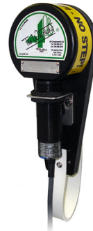
Whirligig® Speed Switch