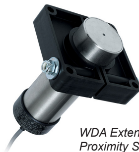
WDA Extended Range Proximity Sensor