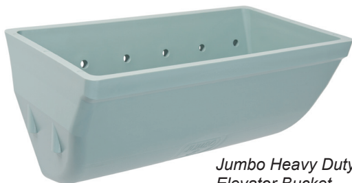
Jumbo Heavy Duty Elevator Bucket