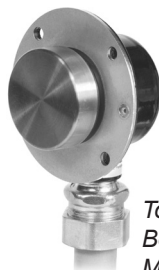
Touchswitch™ Belt and Pulley Misalignment Sensor