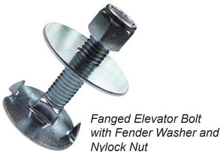
Fanged Elevator Bolt with Fender Washer and Nylock Nut