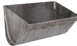
Steel Digger Bucket