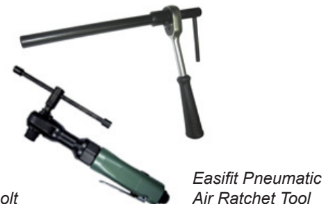
Easifit Pneumatic Air Ratchet Tool

In this article we have shared six common problems identified during 4B bucket elevator inspections. Many other issues can arise and our team of bucket elevator specialists is qualified to inspect and provide solutions to help bring your bucket elevator back to its optimum performance. Call us at 309-698-5611 to book your bucket elevator inspection.