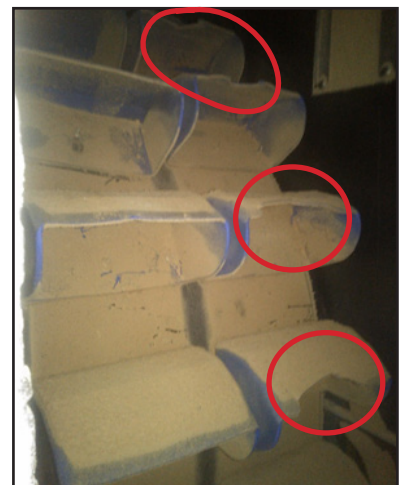
Broken Elevator Buckets

No matter the precautions taken, tramp material such as rocks, metal wrenches and wood boards can find their way into bucket elevators. The impact of these foreign objects in the product stream takes a toll and can result in broken buckets. Impacts can also knock buckets loose from the belt, diminishing throughput and could actually cause a plug condition. Screens and magnets located at the inlet can help capture tramp material before it enters the elevator. And plug sensors can help to detect a blocked chute. Also, heavier duty elevator buckets with stronger front lips can withstand more impact than lighter duty.