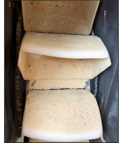
Elevator Buckets with Extensive Wear

If the material being elevated is too abrasive for the bucket resin being used, employing digger buckets or changing to nylon or polyurethane buckets may help. 4B Components' engineering group can assist with these issues along with any corrections to the elevator leg design, belt speed and bucket spacing.