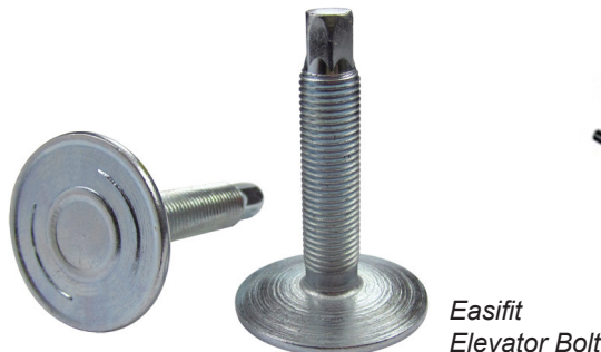
Easifit Elevator Bolt