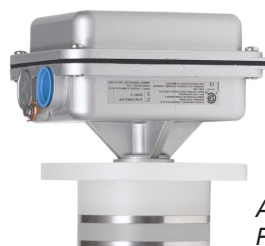
Auto-Set™ Flush Probe Plug Switch