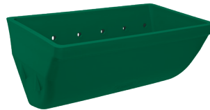
CCS Nylon Digger Bucket