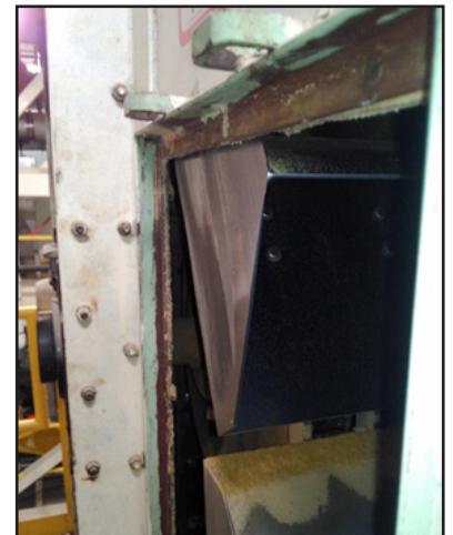
Steel Bucket Rubbing Against the Elevator Casing