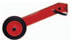
Wheel Encoder Model RWE