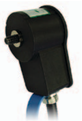
Polypropylene Encoder Model RSEP