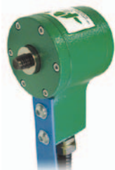
Aluminum Encoder Model RSE