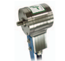
Stainless Steel Encoder Model RSE304SS Model RSE316SS

PRODUCT TYPE - Output Type is Dependent Upon Chosen Pulse Rate