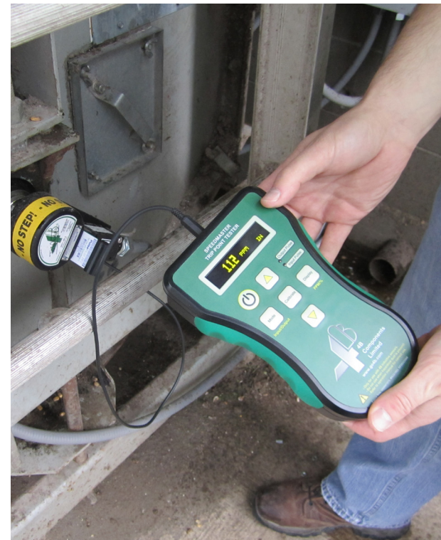
Speed Testing Device

A large, Midwestern grain and feed cooperative grew considerably through organic growth, mergers, and acquisitions. The cooperative management team initiated an operational improvement plan and was also keen on upgrading the company's hazard monitoring to increase the company's safety, up-time, and reliability. The company had a multitude of facilities from small to large; old to new; feed, grain, milling, and fertilizer all with varying levels of automation and monitoring needs. The company's 60-plus facilities are hundreds of miles apart, so reliability, operational testability, remote access, and support were key requirements. The challenge for the company was to find a single vendor that could meet all of these requirements.