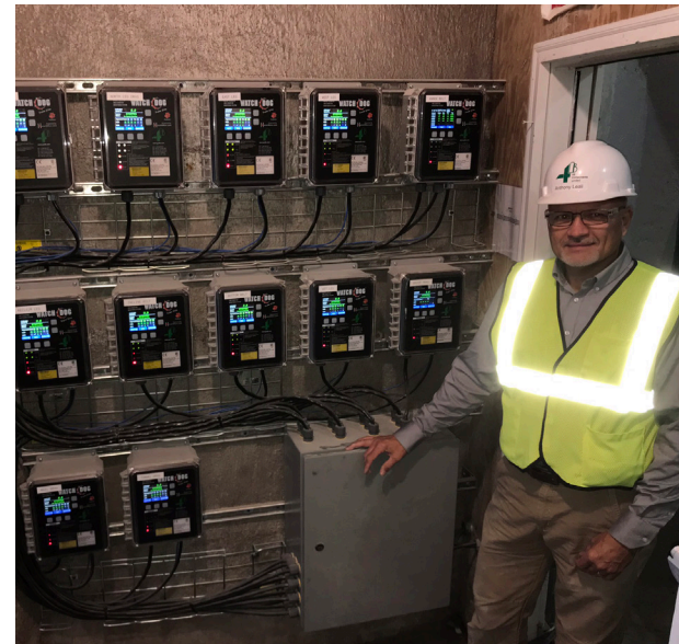
Several Watchdog Super Elite and Flex-Net Industrial Ethernet Systems installed in a facility control room

The company was using at least six different manufacturers of hazard monitoring systems in their facilities, so they had familiarity with a range of available vendors. After extensive research, consultation and analysis, the company selected 4B Components Ltd. as the vendor of choice. The innovative and high quality 4B solutions deployed were: sensors for conveyor speed, bearing temperature, belt alignment, plug condition, slack chain and gate position; Watchdog Super Elite hazard monitor controllers for local control and rapid deployment; Flex-Net System Industrial Ethernet Nodes for remote sensor connectivity; HazardMon.com for cloud monitoring; and testing tools for 100% functional testing and verifiability of sensors and controllers. In addition to providing electronic hardware, 4B toured every facility to assess existing systems and recommend upgrades to ensure successful monitoring, 4B inspected the installation and commissioned startup of the systems, and 4B provided product training to plant personnel and management.