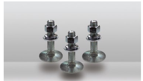
Bolts - Norway Zinc Plated