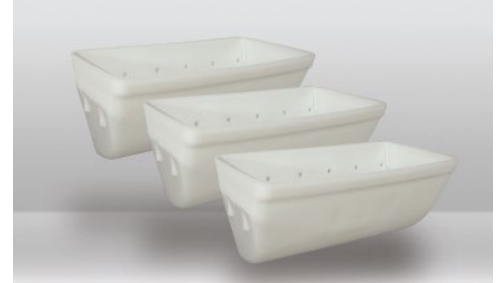
Elevator Bucket CC-S 11"x6"