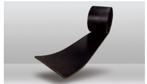
PVC Belt 250# PIW