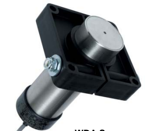
WDA Sensor (WDA3V34C)

Under normal running conditions, the steel flight passes through the sensor's field and a pulse is sent to the speed relay. If the chain becomes slack, the steel flight will drop below the field and the pulses will stop, causing the relay contact to change state.