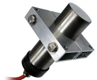
WDA High Temperature Sensor (HTAS1V34)

Under normal running conditions, the steel flight is out of the sensor's field, so no pulses are sent to the speed relay. If the chain becomes slack, the steel flight comes into the sensor's field and a pulse is sent to the speed relay, causing it to change state.