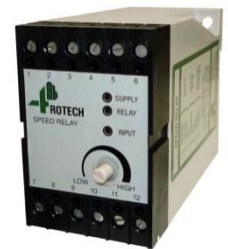
Speed Relay (SR2V5-1)

Under normal running conditions, the target bolt passes through the sensor's field and a pulse is sent to the speed relay. If the chain becomes slack, the target bolt will drop below the field and the pulses will stop, causing the relay contact to change state.