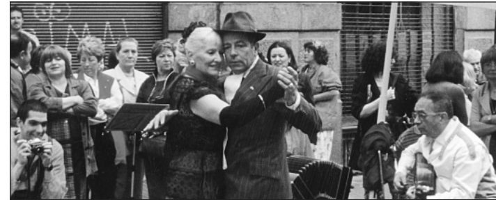
"Tango street scene from Buenos Aires, Argentina"

The Grand Opening of 4B Sudamerica will be held in Buenos Aires during early May