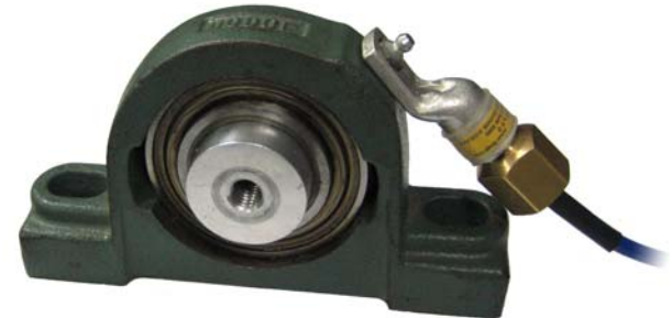
WDB70V3C Installed on Bearing Housing