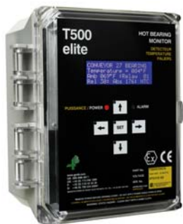
T500 Hotbus Elite

Temperature Sensors can be used with the following 4B Hazard Monitoring Systems