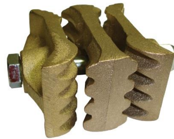
Vise Splice Non-Ferrous (4BVS-AB)