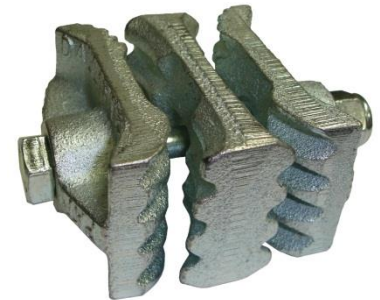
Vise Splice Ferrous (MBG2)

FREE Elevator & Conveyor Engineering Design Service