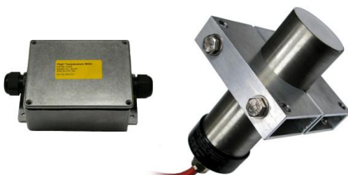
WDA High Temperature Sensor with Remote Electronic Box

Detailed specification, wiring diagrams and installation/operating instructions available upon request.