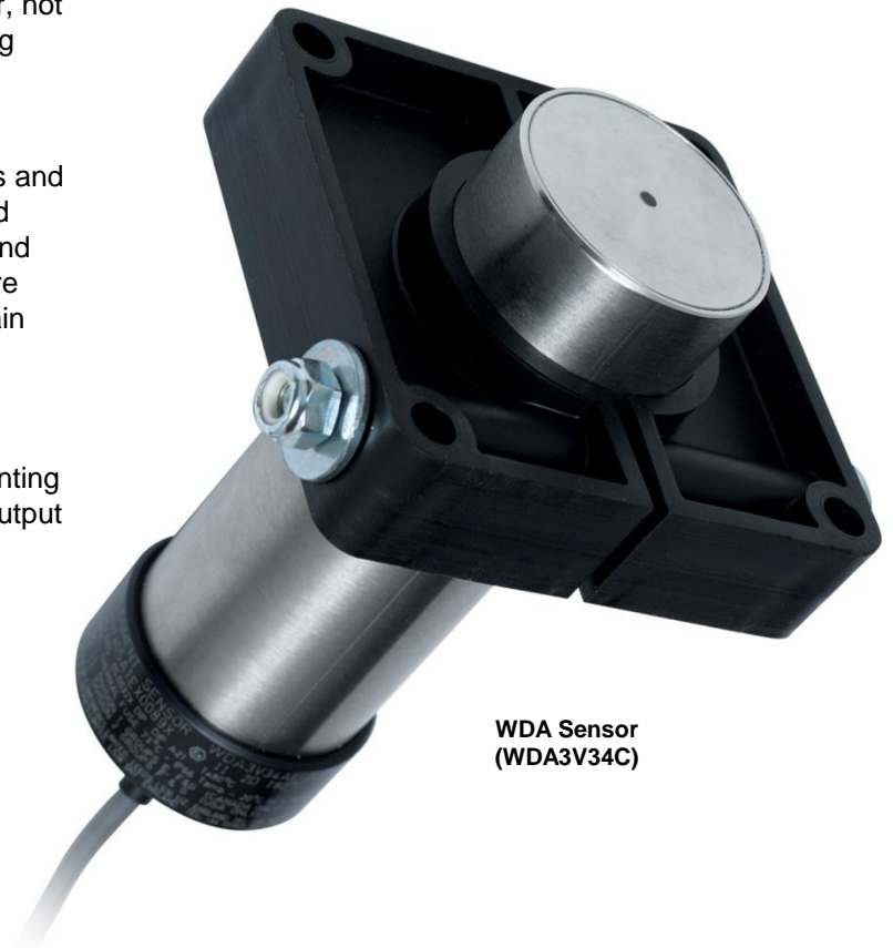
WDA Sensor (WDA3V34C)