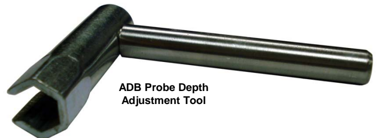
ADB Probe Depth Adjustment Tool