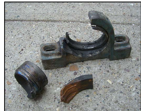
Example of Bearing Failure