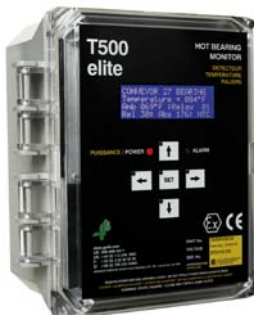
T500 Hotbus Elite

Temperature Sensors can be used with the following 4B Hazard Monitoring Systems