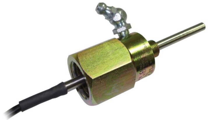
ADB Sensor (CSA Class II Div 1 Approved)